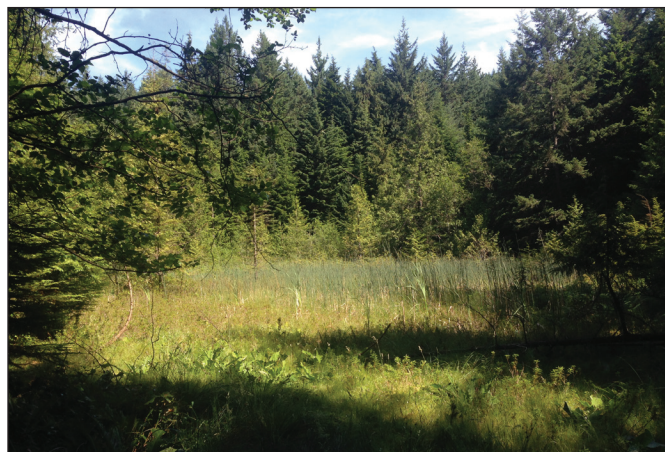
Fairy Fen